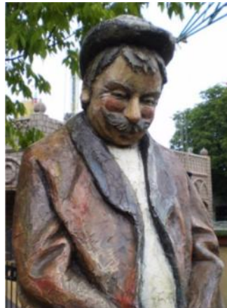
Figure - 2 layer Acrystal Finition - Prater - Vienna - Roland Zojer (Fasching)

ATTENTION: Acrystal Prima is resistant to bad weather, but can not be immersed or splashed continuously. In case of extended contact with water you can either: