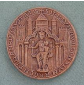
Sceau - Marc Toillié

For the moulding of parts with very fine sections (a few millimetres), it is possible to reduce the mixing ratio of Acrystal Prima from 1 to 2,5 to :