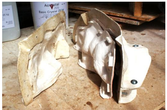
Fine mould case - Frédéric Vincent

Acrystal Prima is the ideal product for the production of light mould cases. The absence of shrinkage avoids the deformations of the mould cases during drying. Therefore it's not necessary to provide metal reinforcements even for large size mould cases.