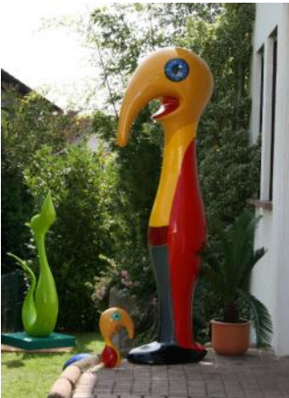
Haptikuss - 2 layers of acrylic paint + 2 layers of glossy varnish - Silvia Baumer

ATTENTION: Apply finishing products only on perfectly dry items (minimum 72 hours drying) in order to avoid blister problems.