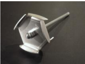
Acrystal mixing whisk

Use a high shear mixing blade at a mixing speed over 700 rpm in order to create a vortex and to break up small lumps.