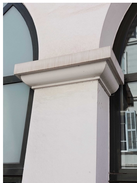
Detail of a column cladding on the facade of the Majestic Hotel – Cannes - Acrystal Prima + Acrystal 200-4D fiber - Laminated panels +/- 7 mm thick